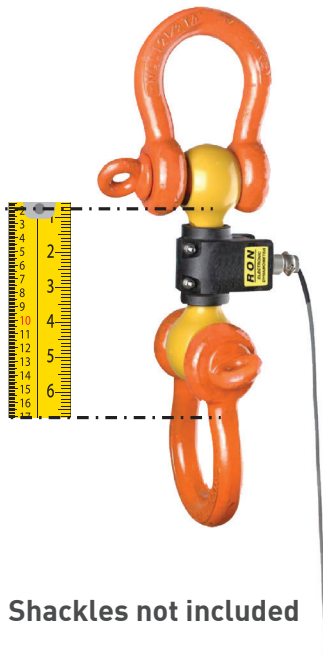
Shackles not included

Environmental: Weather proof NEMA4, IP 65.