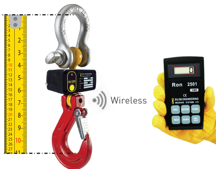
Capacities 0.5t - 15t

Environmental: Weather proof NEMA4, IP65.